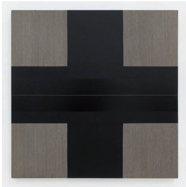
Greek Cross XXX, 2018, acrylic on linen, 96,5 x 96,5 cm