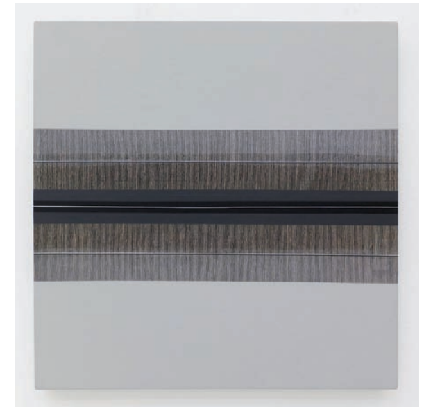
Cross Current, 2018, acrylic on linen, 61 x 61 cm