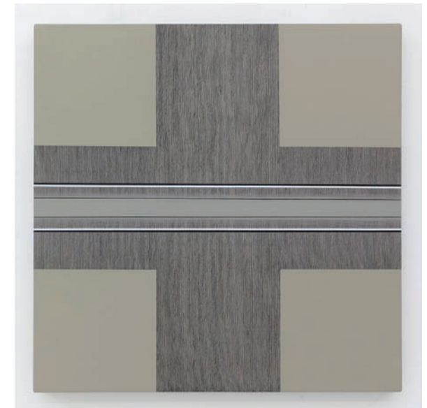
Greek Cross III, 2018, acrylic on linen, 61 x 61 cm